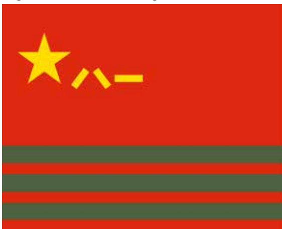
Figure 3. New PAP Flag

other forms of social control, such as CCTV surveillance and the advent of social credit scores. 92 Retaining a formidable PAP presence across the country also suggests limits to the “Wukan model” of addressing protests through dialogue and economic compensation. 93 However, it is likely that PAP rapid reaction units are meant as a backstop rather than a frontline force, as indicated in the new coordination system that makes it harder for local and provincial officials to summon PAP capabilities when needed.